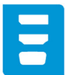
Displayport, HDMI, VEGA