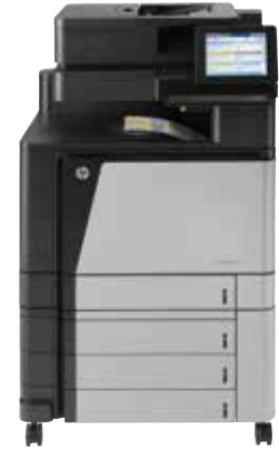
HP Color LaserJet Enterprise flow M880z MFP

This top-of-the-line enterprise MFP helps streamline workflows and accelerate document tasks—with advanced finishing options and file sharing. Give users simple, direct access to this MFP through mobile printing and touch-to-print capabilities. 7